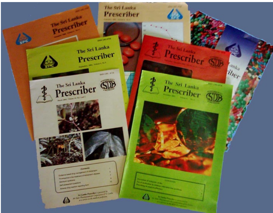
Sample copies of The Sri Lanka Prescriber

I graduated in medicine from the FMC in 1973 and was employed in the Department of Health Services from 1973 to 1984. After three years of postgraduate training in the UK I was appointed as a resident physician. In 1984, I joined the FMC as a senior lecturer in pharmacology and was promoted to associate professor in 1996. In 1997, I was appointed the Professor of Pharmacology at the Faculty of Medical Sciences, University of Sri Jayewardenepura, situated about 10 km away from the FMC. I am also the secretary of the Drug Evaluation Sub Committee, which provides recommendations about registration of drugs to the Ministry of Health. As an editor of The Sri Lanka Prescriber my tasks include taking policy decisions,