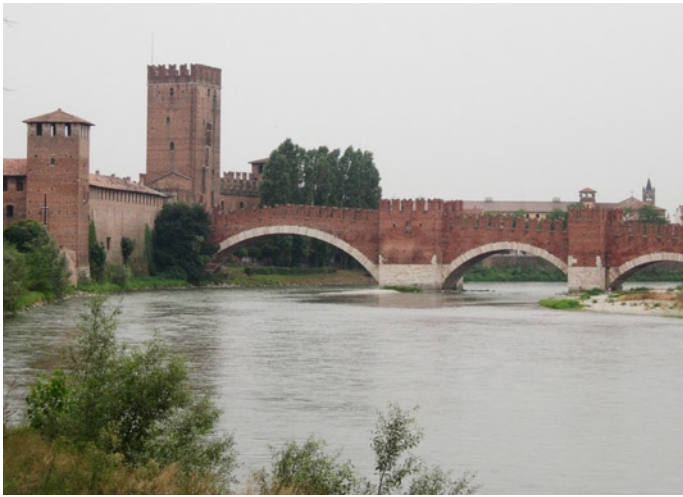
Adige River, Verona